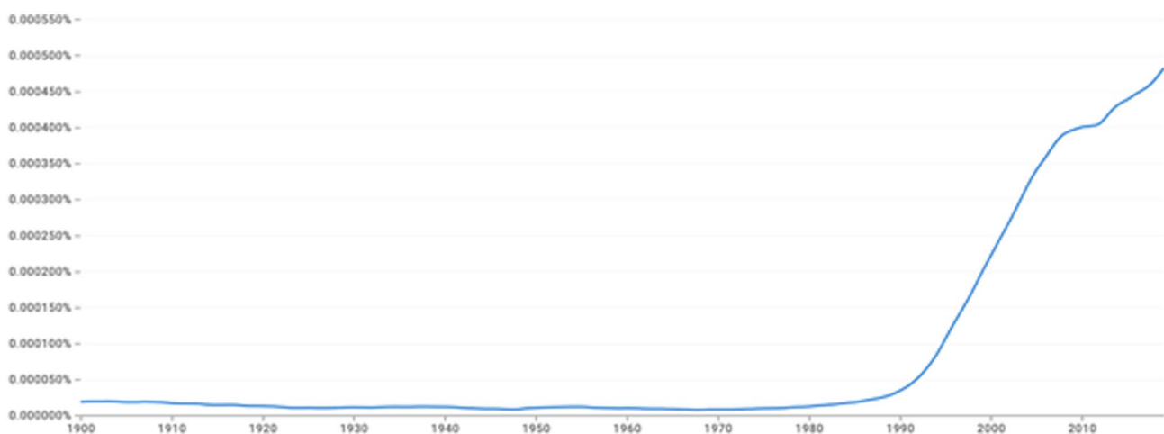
Fig. 1 Increased frequency in the use of the word stakeholder since 1990

In this context, it is worth examining the etymology of the word, and the power relations it has been used to indicate and reinforce. The word stakeholder derives from the word ‘stake’. The original meaning of ‘stake’ was a stick or post,