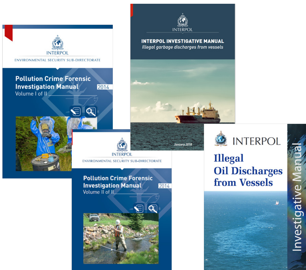
FIGURE 1: Manuals by INTERPOL for Environmental Crime Investigation.

tal Crimes Task Force, 2005). Although the purpose of this document is to provide practical information for the investigation of potential environmental crimes, its scope is also limited to evidence collection and preservation. There are manuals/handbooks prepared by many other US States on Environmental Crimes, like the 'New Jersey Environmental Crimes Handbook', 'Louisiana Environmental Crimes Handbook', etc., but the focus is on listing different types of environmental offenses and the legal provisions to tackle those offenses. The 'Royal Solomon Islands Police Force (RSIPF) Environmental Crime Manual', although elaborate, focuses on types of environmental offenses, legal provisions against those offenses, procedures in its trial and the punishments.