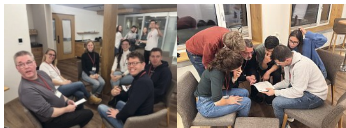
The two pub quiz winning teams.

The second day started early for people who wanted to enjoy the slopes of the Allalin mountain. The conditions were simply perfect: fresh snow and a sunny day were waiting for the participants. The organizing committee provided the attendants with a variety of snow activities, from skiing and snowshoeing to relaxing in a spa.