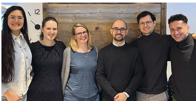
Fig. 5. Organizing Committee SSS24.

We want to thank all sponsors for their generous support and finally all the speakers and participants for contributing to this fantastic experience.