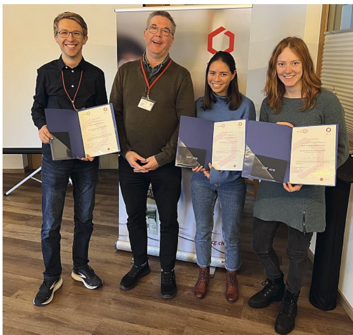
Fig. 4. Awardees of Best Talk and Best Poster Awards sponsored by Helvetica Chimica Acta .