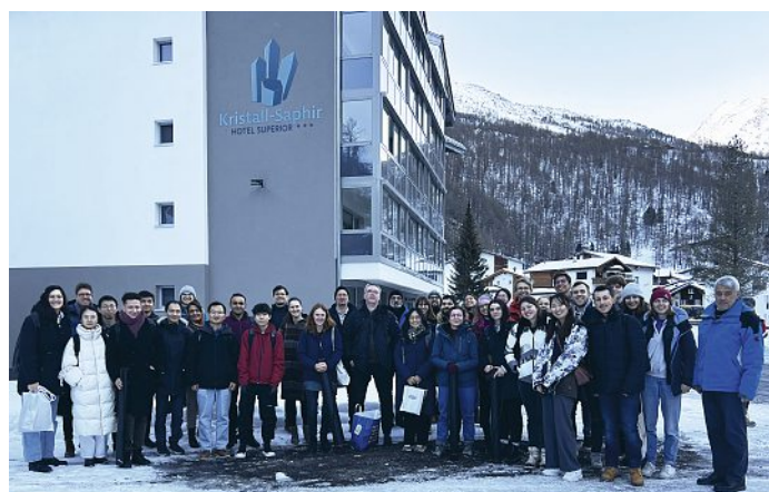
Swiss Snow Symposium 2024 group picture.

This year's Swiss Snow Symposium took place in Saas Almagell from Friday, the 19 th to Sunday, the 21 st of January 2024.