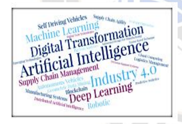
Figure 1. Word cloud made from the keywords used

When it comes to the implementation of artificial intelligence, however, several nations employ a variety of ways. Mohan Kunkulagunta (2024) As an illustration, information technology businesses in the United States are participating in a vigorous battle to create and implement AI and ML strategies, with the support of the government. (Kaplan and Haenlein, 2019) In other nations, such as China, the government is responsible for monitoring and controlling all technologies connected to artificial intelligence. Mohan Kunkulagunta (2024) In order to ensure that the privacy of their inhabitants is adequately protected, the nations that make up the European Union (EU) have put restrictions on the ways by which data can be gathered and processed (Farrow, 2019).