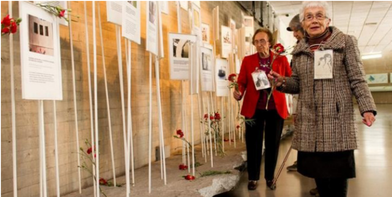
Museo de la Memoria y los Derechos Humanos Chile, a member of the International Coalition of Sites of Conscience(2)