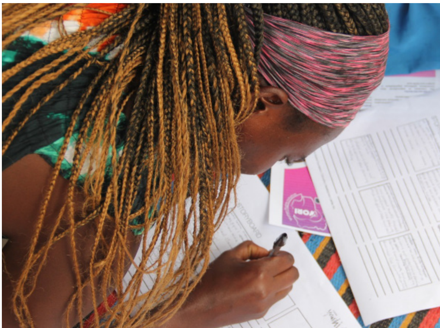
Women Rights Initiative (WORI), Uganda, a member of the International Coalition of Sites of Conscience