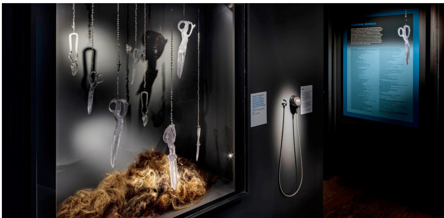
(A)Dressing Our Hidden Truths 3 by Alison Lowry