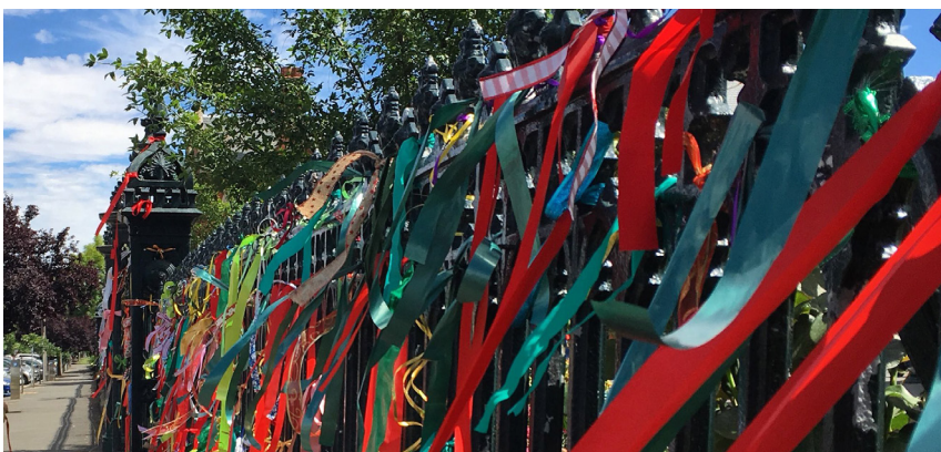
Ribbons in Iron Fence of St Patrick's Cathedral Ballarat