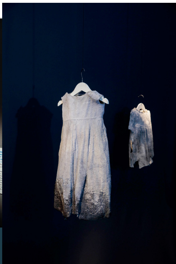
(A)Dressing Our Hidden Truths 4 by Alison Lowry