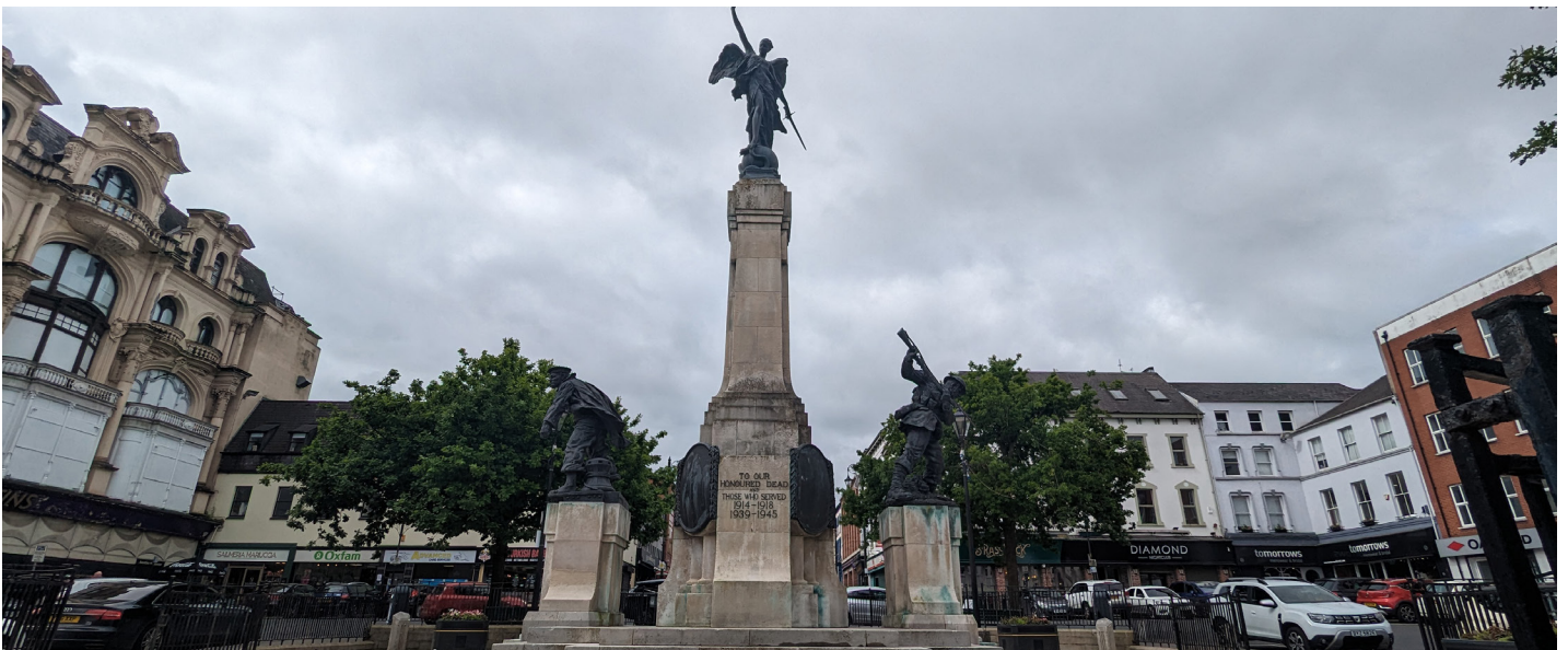
Diamond War Memorial, Derry, Northern Ireland