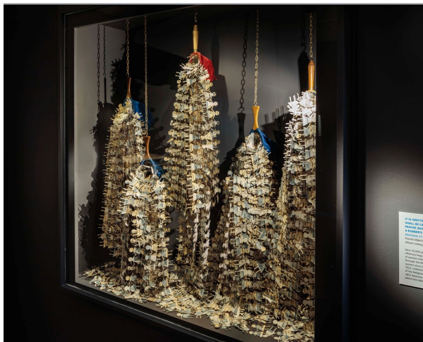
(A)Dressing Our Hidden Truths 3 by Alison Lowry

Located in the National Museum of Ireland – Decorative Arts and History in Dublin, Lowry described how the exhibition's setting adds another layer of depth to the viewer's experience. The dimly lit space with black-painted rooms creates an atmosphere of solemnity and introspection. The exhibition takes visitors on an emotional journey through the shadows of history. On entering the exhibition, visitors are greeted by a life-size apron made from unfired pâte de verre over fabric, symbolising the work and loss of identity experienced by women in these institutions. Another piece features glass scissors dangling from rosaries amid piles of human hair – a chilling representation of the dehumanisation and cruelty endured by internees.