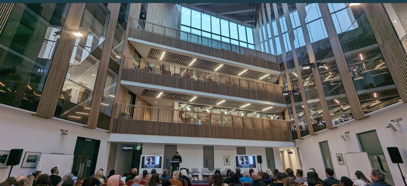
Audience in Belfast Campus