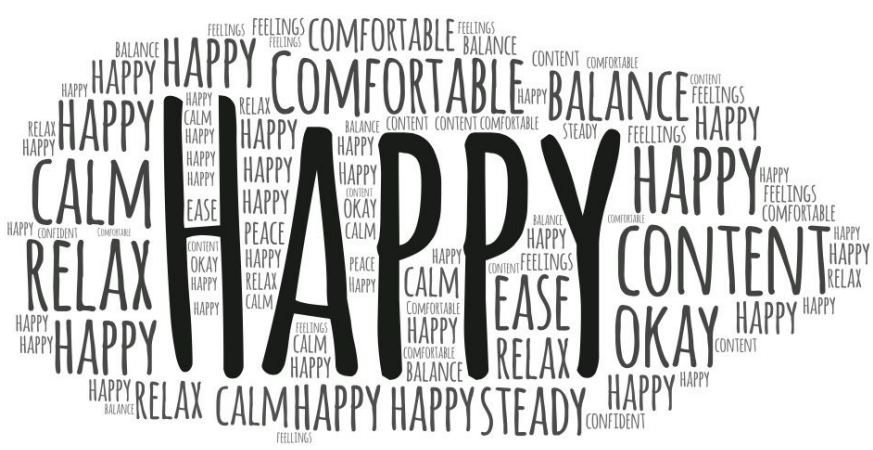
Figure 2: Word cloud depicting positive affective states described by participants in this study.

1 2 3 4 5 6 7 8 9 10 11 12 13 14 15 16 17 18 19 20 21 22 23 24 25 26 27 28 29 30 31 32 33 34 35 36 37 38 39 40 41 42 43 44 45 46 47 48 49 50 51 52 53 54 55 56 57 58 59 60