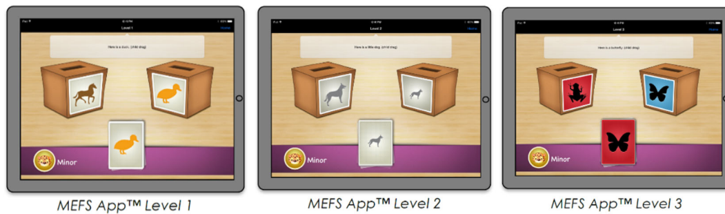
FIGURE 1 First three levels of the MEFS App™. Children are instructed to sort cards into boxes based on a specific rule that increases in difficulty when a child progresses through the levels (displayed here: 1: horses versus ducks, 2: large versus small, 3: red versus blue).

algorithm that takes both accuracy and response time into account, with higher scores reflecting better executive function skills. In analyses, either raw or standardized scores were used (see Section 2.4). Standardized scores were calculated differently depending on the recruitment site. For children from the Netherlands, scores from the current control group were used to calculate standardized scores (percentile scores). For children from the United States, scores from the general population were provided by the MEFS-app and converted into standardized scores (percentile scores).