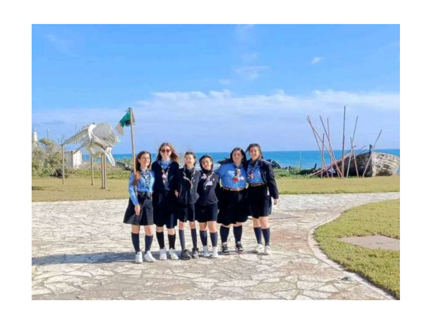
Gibellina 1 - Scout Group, Panther squadron, "Nature Enterprise" Department activities at CNR-IAS Detached Unit of Capo Granitola.