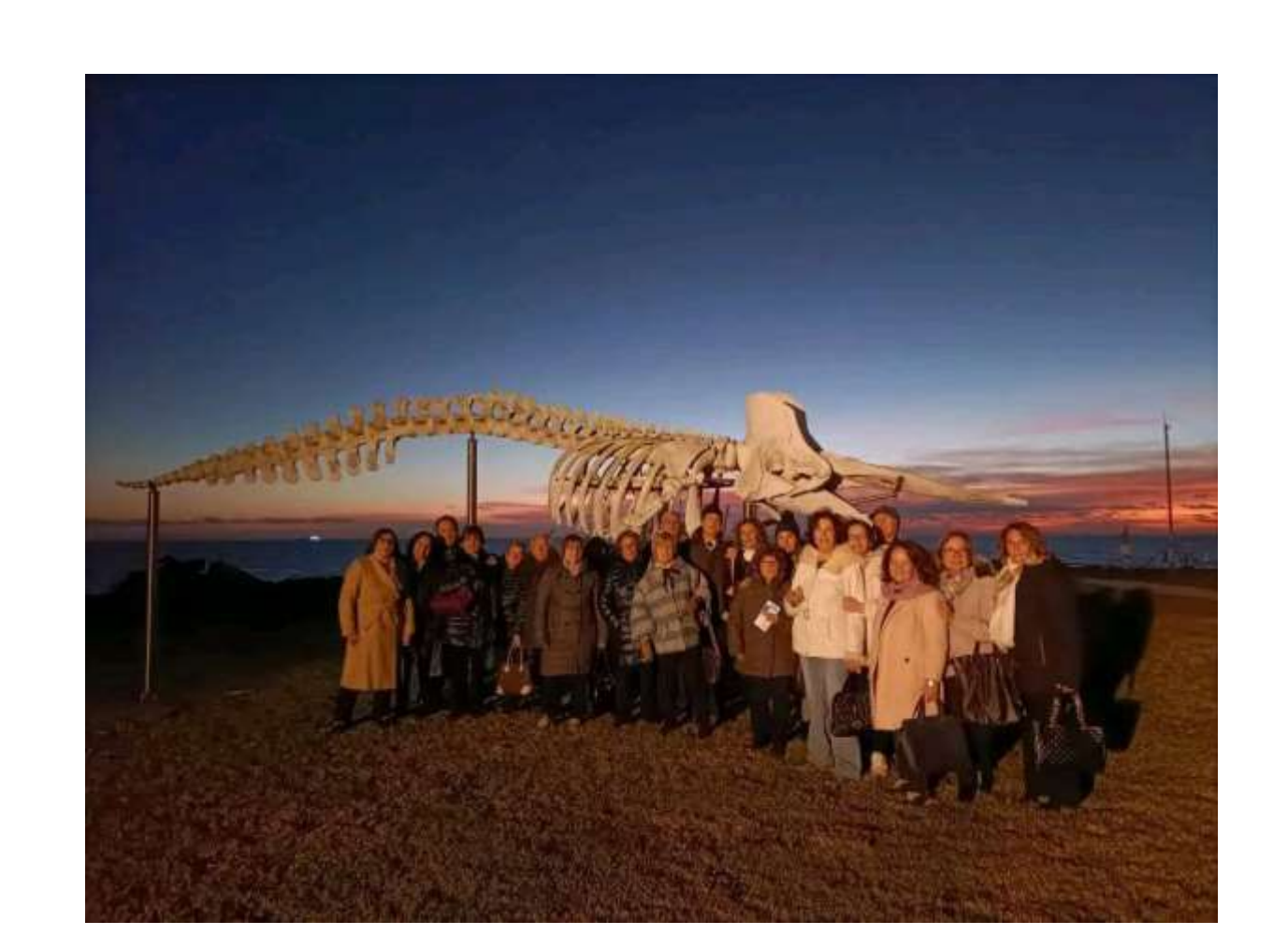
Mazarese Popular Free Age University "G. Alestra" visiting CNR IAS Detached Unit of Capo Granitola to discover biodiversity and the profession of a scientist.

In SPOKE 7, the #BiodiversityFestivalontheroad activity falls within the BIODIVERSITY AND SOCIETY - Communication, education and social impact section and has the objective of communicating and enhancing scientific research by actively involving stakeholders using an integrated communication strategy, in which the activities of scientific research are promoted through direct contact between science and society in a space well embedded in the territory and culture.