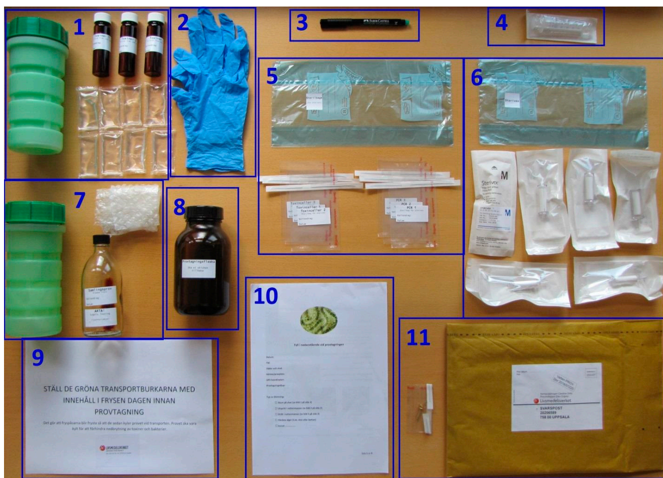
Figure 4. Cyanobloom sampling kit: (1) green transport container with 7–8 freezer bags and three brown filtrate bottles labeled “Toxins 1–3”; (2) a pair of sampling gloves; (3) a permanent marker; (4) a syringe; (5) freezer bag, marked “Steribag/For Sterivex” containing 3 sterile bags marked “Toxin cells 1–3” and 3 sterile bags marked “PCR 1–3”; (6) freezer bag, labeled “Sterivex” containing 6 Sterivex filters; (7) green transport container with “Sample collecting bottle” with 1 mL of Lugol’s solution and bubble wrap for transport; (8) large sampling bottle, amber; (9) sheet with the information to place the kit in the freezer the day before sampling; (10) algal bloom sampling protocol; and (11) padded return envelope with the accessories for closure.

For sampling purposes, a sampling kit was prepared at SFA according to Figure 4, containing a written protocol for sampling and sample handling at the sampling site (Supplementary Material S1). Amber glass bottle with a wide opening (1000 mL) was used as a sampling vessel to take the samples. Polypropylene syringe (Discardit II 10 mL, Beckton Dickinson and Company, Franklin Lakes, NJ, USA) was used for aspiration of a sample from the sampling vessel. Sterivex filter (0.45 \mu\text{m} , MilliPoreSigma, Fisher Scientific GTF AB) was used to filter raw water sample containing cyanobacteria into an amber glass vial (20 mL, Skandinaviska Genetec, Västra Frölunda, Sweden). For further sample preparation in the laboratory, a vortex from Genie 2 Scientific Industries, a Thermo Scientific Haraeus Multifuge 3SR+ centrifuge, and an ultrasonication device were used. Mass spectrometry (MS) analyses were performed using a Waters Xevo TQ-S triple quadrupole mass spectrometer coupled to a Waters Acquity UPLC i-Class with a flow through needle sample manager.