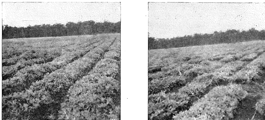
Fig. 2.—Observation plots, Wondai, 1956-57 season. Plot on the left treated with captan, that on the right with "Ceresan."