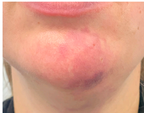
Fig 3. Patients in Fig 2 and Fig 3 have similar reticulated patterns of the chin; oval-shaped with a broad basis ending in a point reaching cranially toward the lower lip.