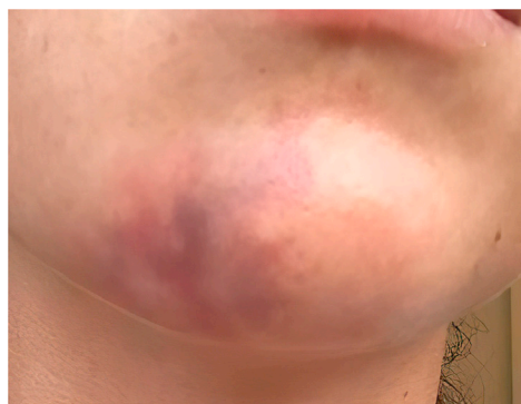
Fig 2. Patients in Fig 2 and Fig 3 have similar reticulated patterns of the chin; oval-shaped with a broad basis ending in a point reaching cranially toward the lower lip.