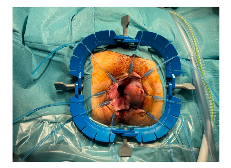
Fig. 4. Photo of the tumor recurrence during inspection at the operation room. A true cut and incision biopsy was taken.