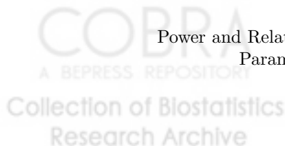
Table 10.3 Power and Relative Efficiency of Wilcoxon and t Tests in a Parametric Shifted Exponential Model