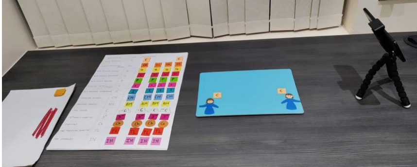
Fig. 1. Set up at the start of the study. From the left, WikkiStixs and extra unlabelled felt icons; the 14 icons of entities which could be used in making a representation, with short labels on the icon and longer explanations next to them; the Fuzzy-Felt flocked board with two items, one of a sender of a message and one of a receiver (only one was needed for the main sessions, this arrangement was for the demonstration by the researcher, see section 2.3); smartphone on tripod set up to record the session.

A recruitment questionnaire collected demographic information from participants and asked them to rate themselves on their expertise with computers and the internet, and on their expertise about online security issues (both on scales from “not at all expert” scored as 1 to “very expert” scored as 7). Participants were asked where they learnt about online security issues.