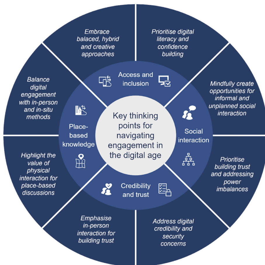
Fig. 2. Recommendations for environmental practitioners: Key thinking points for navigating engagement in the digital age.