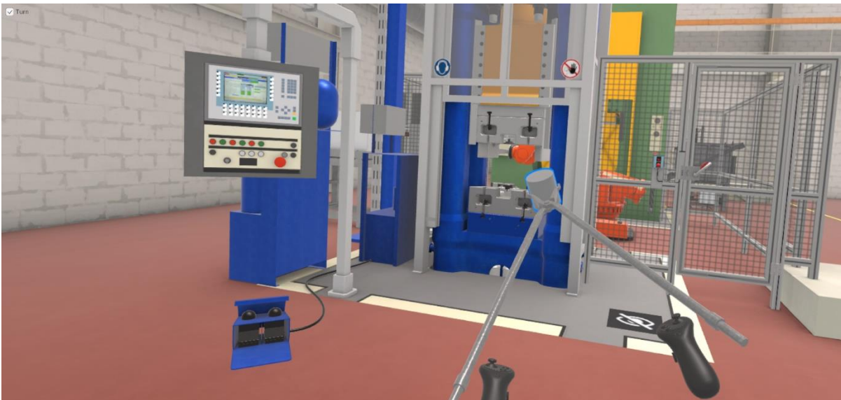
Figure 3. The learner manipulates a billet using a wrench

With the help of an interactive digital twin of the forge, learners have the opportunity to redo practical exercises from home or on campus whenever they wish for revision. This tool goes beyond a simple video presentation of the content because students can actively replicate the actions, such as handling metal pieces, themselves (see Figure 3).