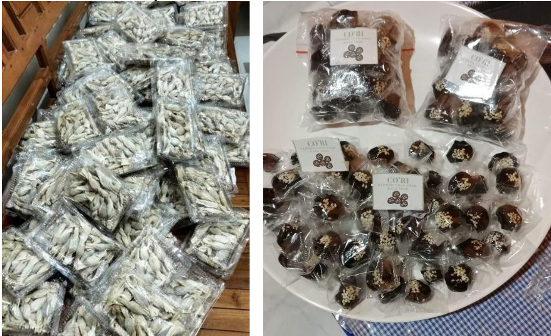
Figure 5. Co'ri .

Another typical food was called Co'ri (Figure 5); this traditional snack with a caramel taste sensation was unique because it was served in small pieces of bamboo. This way of serving was one strategy to attract the attention of visitors who wanted to try Co'ri .