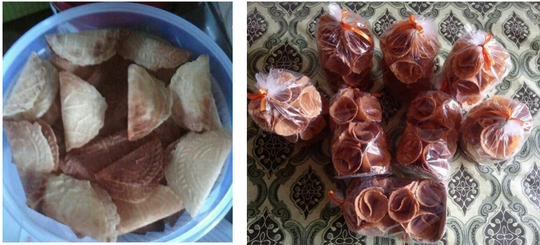
Figure 3. Kasippi

Second, Kasippi . Kasippi (Figure 3), a delicious typical Polewali Mandar food, is often used as a souvenir when visiting Polewali Mandar because it is easy to carry and is light in weight. However, good packaging would help ensure this Kasippi was not destroyed during the trip.