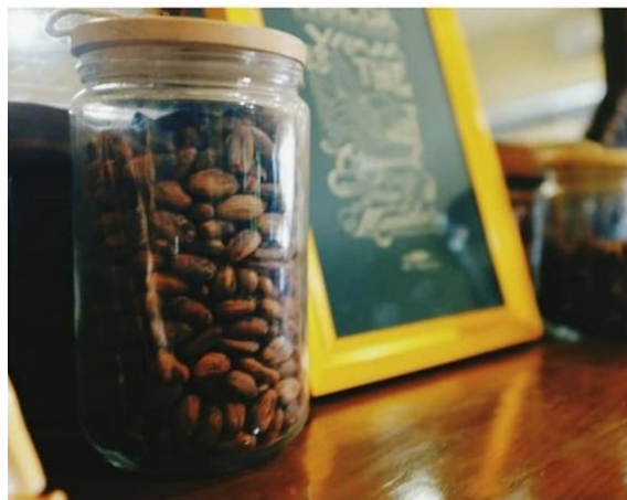
Figure 4. Macoa Chocolate

Third, Macoa Chocolate (Figure 4). Macoa Chocolate was often said to be the chocolate of the Mandar people because it was the only and first chocolate bar producer in Polewali Mandar. West Sulawesi was the largest producer of cocoa beans. (Jayanti et al., 2021) It was stated that the added value obtained from 80% maca dark chocolate bars is IDR 406,640 per kilogram, with a total production of 80% maca dark chocolate bars of 27.6 kilograms per production period in Wonomulyo District, Polman Regency. Macoa chocolate was processed from selected raw materials obtained from native farmers in West Sulawesi. This chocolate comes from quality beans from healthy and hygienic fermentation. The processing process was based on the results of observations on the CV. Putra Mataram in the form of chocolate bars melted and molded into various shapes of chocolate candy. Add various fillings such as nuts, dried fruit, or caramel for flavor variations.