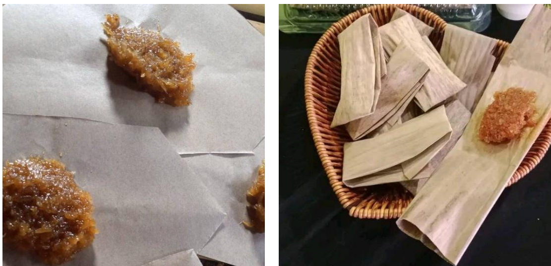
Figure 2. Baye or Golla Kambu

Polewali Mandar, of course, also had cultural diversity, like most regions in Indonesia. One thing you can enjoy is a variety of typical Polewali Mandar foods. The following is a list of typical Polewali Mandar foods, which can also be used as typical Polewali Mandar souvenirs. First, Baye or Golla Kambu ( Figure 2 ). The first typical Polewali Mandar souvenir was Baye . Baye or Golla Kambu was one of several typical Polewali Mandar foods that enrich culinary tourism in Polewali Mandar. This food was known to most of Polewali Mandar, West Sulawesi, and even outside Sulawesi.