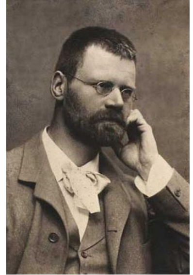
Axel Olrik circa 1916