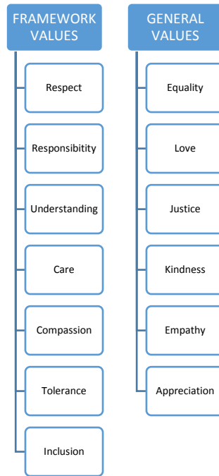
Figure 2: The Values Identified in Preference Order.