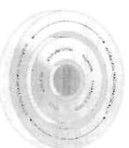
Figure 2. Working Mathematically (Curriculum Council, 1998, p. 182)

Prior to the ACM, states such as Western Australia employed their own curricula and included something referred to as 'Working Mathematically' (Curriculum Council, 1998). Working Mathematically had the same essential elements as the proficiencies, but laboured under the issue of being seen in the same vein as the content strands. In fact rather than being something which was incorporated into all of the other strands as intended, it was often seen as another lesson and timetabled as 'problem solving'. Although this was not the intent, for many teachers it became the practice.