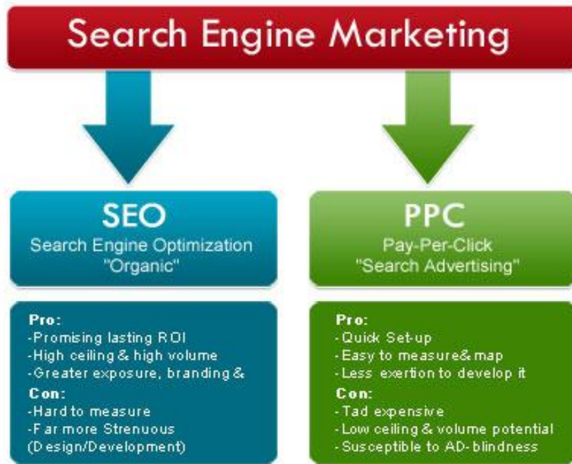
Fig.1: Flowchart representing the Relationship between Search Engine Marketing and PPC

SEM is owed while PPC is paid for SEM. PPC is one of the quickest kinds of digital media platforms to push real traffic on the websites and the services you offer. Pay per click can be interpreted to purchasing browsers through paying search lists to support site traffic to advertisers via desktop and smartphone web search. SEM synonym include pay-per-call (pay-per-call), CPC (cost-per- click), Pay-per-clicking (pay-per-call), and CPM. There are several various SEM related synonyms and acronyms (cost-per-thousand impressions).