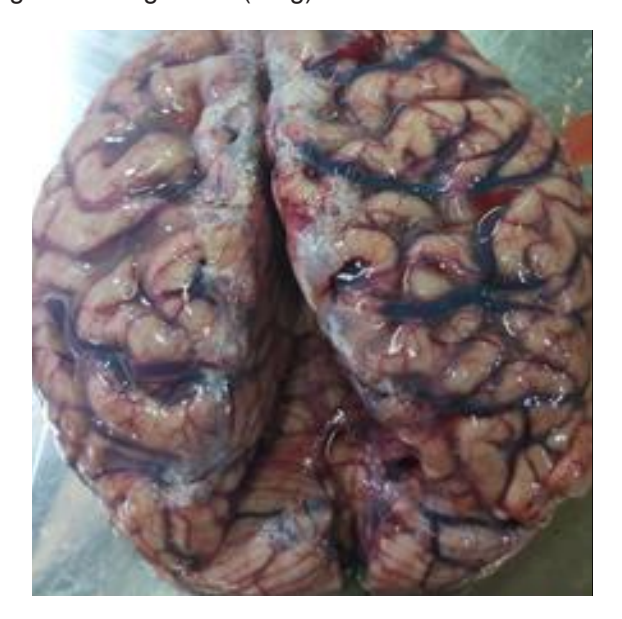
Figure 2- Prominent engorged cerebral vessels on the right hemisphere.

The neck muscles, bones, and cartilage were intact, including the hyoid bone and thyroid cartilage. The larynx and trachea were patent with thyroid gland enlargement (30 g). The intercostal muscles