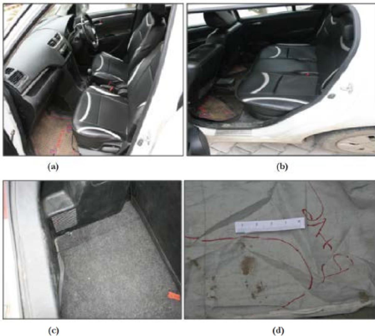
Figure 1- The interiors of the car used for the commission of the crime (a) the front seat, (b) the rear seat, (c) the black mat recovered from the boot, (d) the car cover recovered from the boot.

Tooth DNA extraction initially involved two main steps,