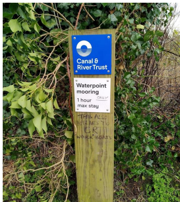
Figure 2. Additions to official signage illustrating diverse Boater frustrations – with each other, and with the CRT – on the Kennet & Avon Canal.

Note: It is generally accepted that each boat should vacate the water point as soon as its tank has been filled.