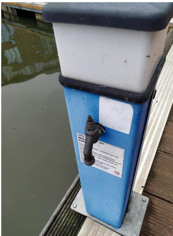
Figure 12. Broken tap on a mooring pontoon in Bristol Floating Harbour (left); a repaired tap on the Kennet and Avon canal (right)

Despite the strength of disgust expressed by several respondents on this point, a couple of interviewees considered Elsans to be fine to use in general. Both the frequency and condition of different types of facilities often depended on location. Within cities, more service points tended to be available but with a higher number of people using them, so blockages and hygiene issues were more common. In rural areas, issues tended to relate to broken facilities or large gaps in between service points.