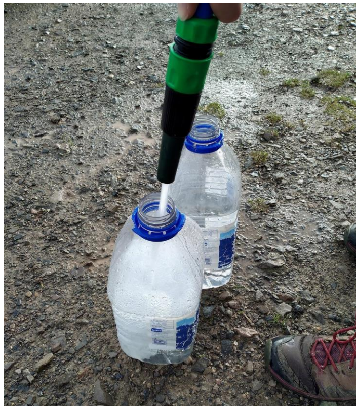
Figure 5. The 5L bottle is a popular canal accessory.

Note: I use my 5L bottles for drinking water, as I prefer not to drink from the integral water tank. They are rinsed and refilled roughly every two weeks and kept in service for several years.