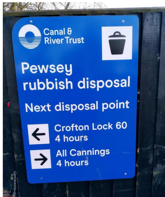
Figure 11. A sign at a CRT service point on the Kennet and Avon canal.

Note: Distances between service points can be measured in the hours it takes to cruise between the points (including working out 'lock miles' by adding the distance in miles to the number of locks that must be navigated, before dividing by three to ascertain the number of hours the journey should take). Longer narrowboats may also have to find the nearest 'winding hole' in order to turn around and return to a service point, making journeys even longer.