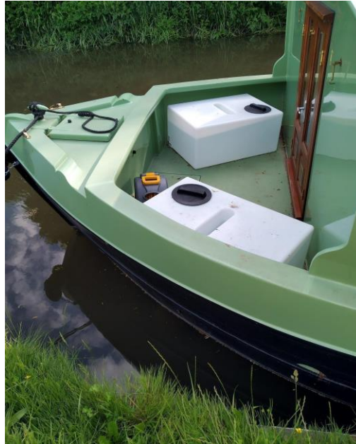
Figure 10. Widebeam boat with extra water tanks.

Note: Some Boaters may be perceived to have more financial and material resources: For instance, I noticed this widebeam boat that seemed to be almost brand new and that had extra water tanks in the bow. However, these (assumed) extra financial resources are not yet matched by the experiential knowledge to anticipate that the water will go green with algae if left exposed to the sun, or that such large heavy tanks will adjust the trim of the boat and be tricky to empty in order to make use of the stored water.