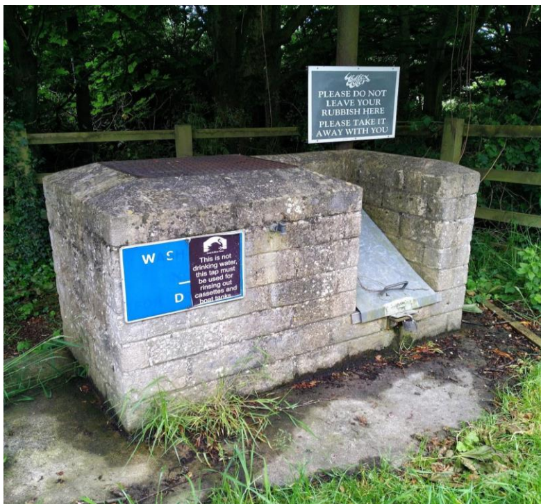
Figure 6. An Elsan station on the River Avon near Swineford.

Note: A particular hygiene concern is that of people using the wrong hoses, particularly as sanitation facilities (Elsan disposals and pump out machines) and drinking water provisions are often found adjacent to one another. I've heard several Boaters tell stories of watching in horror as people hiring boats for their holidays innocently fill their freshwater tanks using the hoses provided for rinsing out toilet waste tanks.