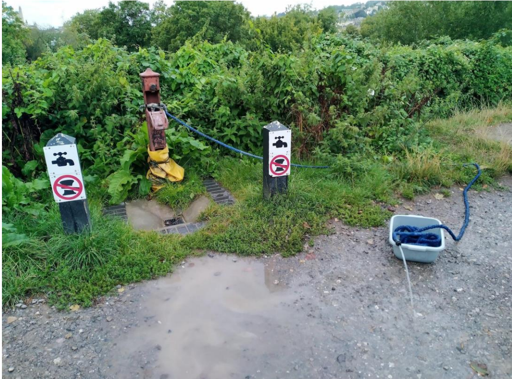
Figure 13. Water provision on the visitor moorings in Bath (Kennet and Avon Canal).

Note: The water pressure at this tap was so low that it wasn't sufficient to make my 'expandable' hose stretch to reach the tank at the bow of my 60ft narrowboat. We left having filled up a few 5L bottles, but with an almost empty tank. Also of note here is the somewhat confusing 'no mooring' signage and the addition of a plastic bag, perhaps as part of an attempted amateur repair.