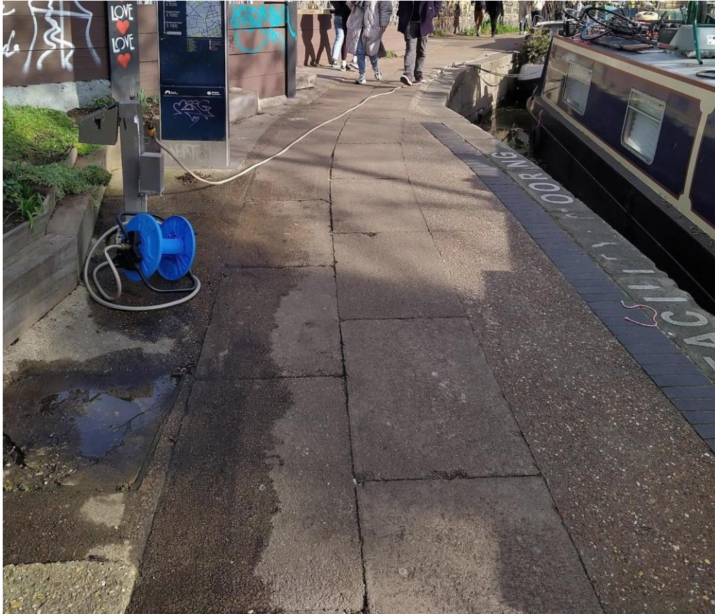
Figure 1. Accessing water as an itinerant boat dweller.

Note: Accessing water as an itinerant boat dweller involves navigating to canal-side taps, most of which are provided and maintained by Canal & River Trust, such as this one on the Regent's Canal in Angel, London. On this busy Sunday afternoon there was a queue of three boats waiting to fill their tanks, necessitating a likely wait of over two hours (depending on water pressure, number of boats, and the volume of their tanks).