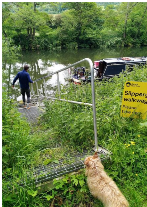
Figure 9. Service station provided by Wessex Water/CRT on the River Avon near Swineford.

Note: Some service stations – such as this one – can be particularly challenging to access: steep, slippery (to the point of requiring signage!) and overgrown, and in this case only open from spring to autumn.