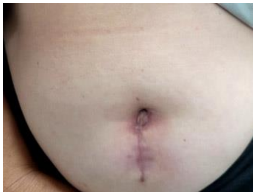
Fig. 3 - Final outcome of surgery, 3 months later.

The patient was discharged 24 hour later without complaining. Pathology reported a Clark’s nevus with total excision. On day 6th of post-operatory a seroma was evacuated without any other complications. On 3 months consult the patient presented a total healing scar (Fig. 3) and she referred being satisfied with the outcome of surgery.