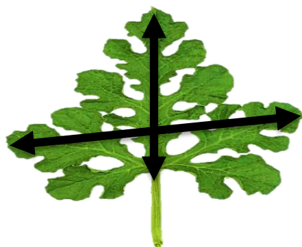
Figure 2. The leaf area (LA) of watermelon were estimated using the equation LA = 2.99 + 0.50LW