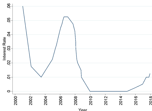
FIGURE 2. EVOLUTION OF THE INTEREST RATE OF THE FEDERAL RESERVE IN THE PERIOD 2001-2017

Source: Own elaboration according to data of Federal Reserve (2019).