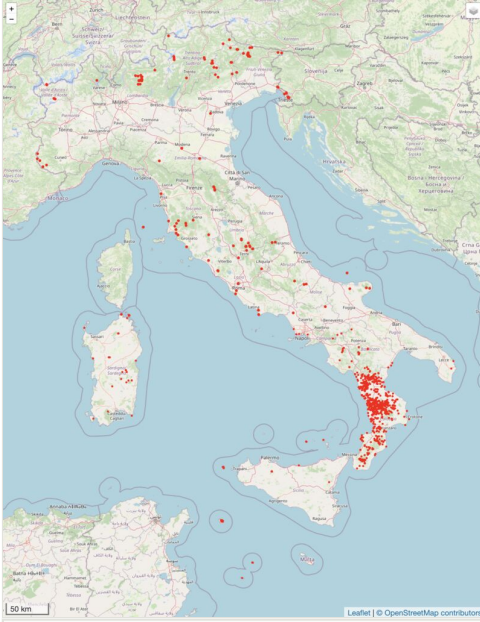
Figure 1. doi

are provided in tabular format (Suppl. material 1) and as a Krona graph (Suppl. material 2, Ondov et al. 2011).