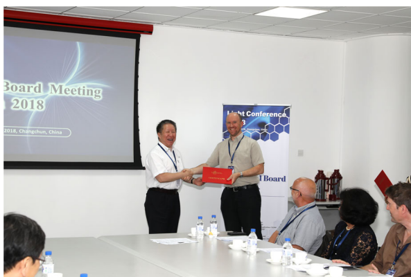
Prof. Jianlin Cao appointing Prof. Martin Booth as an Editor of LSA

There are many promising prospects in extending the use of polarisation for biomedical applications, particularly as it can provide label-free contrast. Combining this technology with AO will aid the use of such methods in three-dimensional specimens. There is also the prospect of using adaptive elements to simplify the design of polarimetric microscopes for more practical applications.