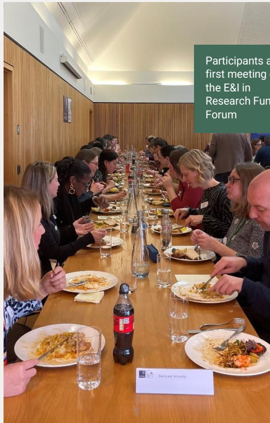
Participants at the first meeting of the E&I in Research Funding Forum

Consequently, the event that took place on 27 February in Oxford considered i) the principles by which the proposed Forum would operate, ii) the priority areas that it would focus on and iii) the mechanism through which the priorities would be delivered, i.e. the Terms of Reference of the Forum.