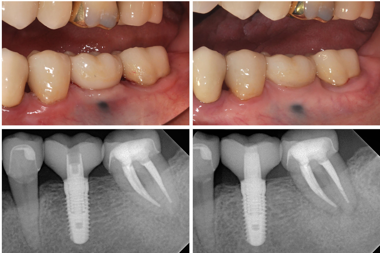
FIGURE 3 Photographs (upper left: delivery, upper right: recall examination) and radiographs (lower left: delivery, lower right: recall examination) of a screw-retained HAC that replaced the mandibular left first molar (exemplary). The interval between examinations was 4.1 years and the total FIPS score was 10.

of delivery of the crowns, other relevant data, and all adverse events were extracted from the patients' medical records, including type and time of complications. The complications were classified into "technical" and "biological" (Table 1).