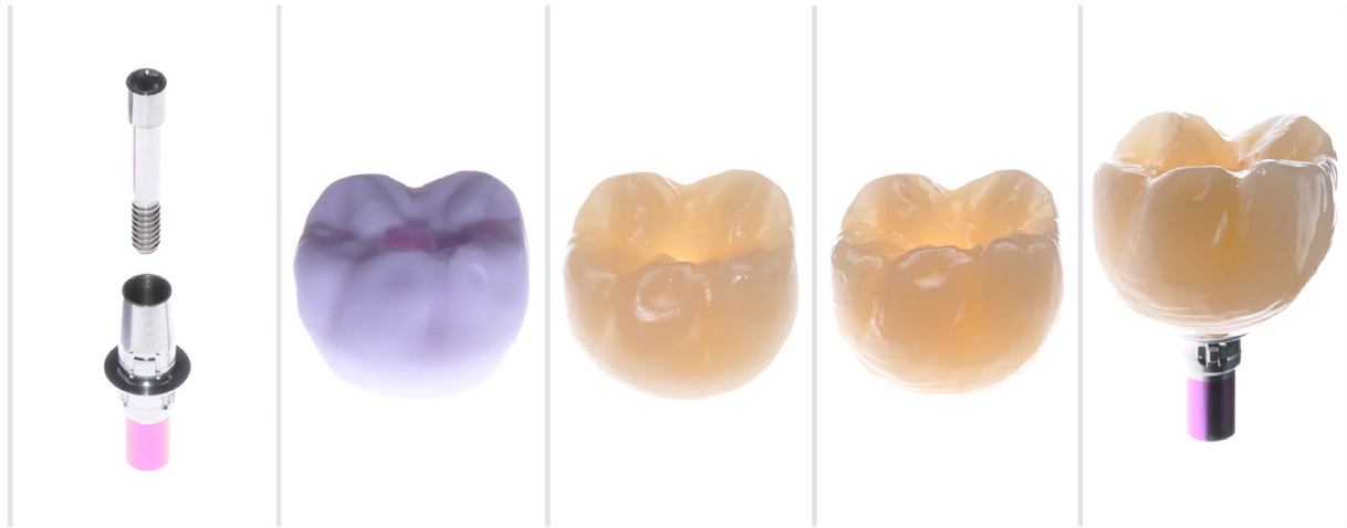
FIGURE 2 Components of a HAC that replaced a mandibular molar (example) from left to right. Titanium base CAD-CAM abutment and screw, milled crown in the lithium metasilicate phase, after sinter-firing, after glaze-firing; and lithium disilicate crown adhesively bonded to the titanium base abutment.