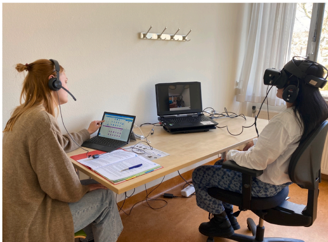
Fig. 2. Example of researcher and participant in session.