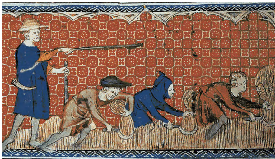
Fig. 1: Medieval illustration of men harvesting wheat with reaping-hooks, on a calendar page for August. Queen Mary's Psalter (Ms. Royal 2. B. VII), Public Domain, Wikimedia, https://commons.wikimedia.org/wiki/File:Reeve_and_Serfs.jpg .