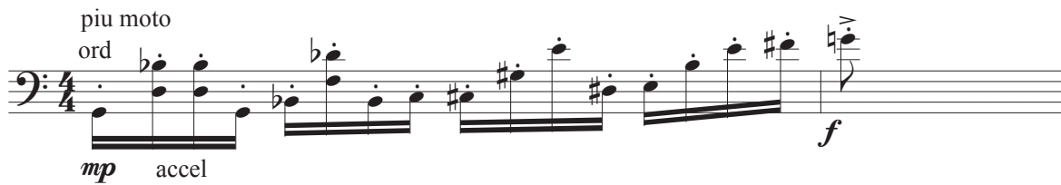
Example 4: Fantasia for Solo Cello , some of the various versions of the minor triad