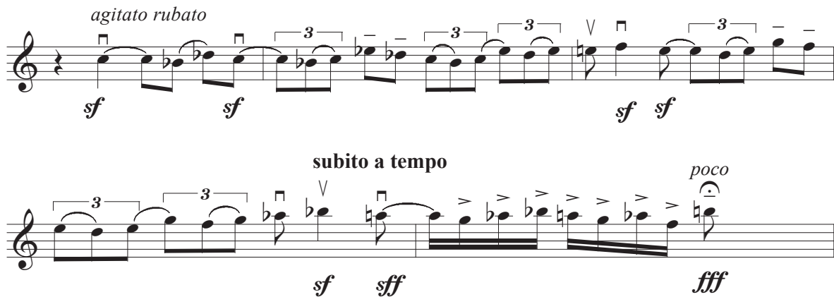
Example 16: Fantasia for Solo Cello , bars 89–93

It appears spasmodically in the earlier sections of Fantasia , but, as one might expect, reaches its apotheosis in the final climactic frenzy (89–93):