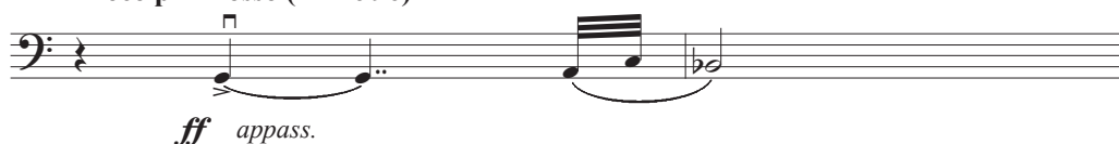
Example 2: Fantasia for Solo Cello , bars 37-38

Just as Example 1 is an archetypal ‘fanfare’ figure, Example 2 is an archetypal scherzo appassionato one. Its rhythm is that of a ‘French overture’, of course, though in this register and instrumentation we are unlikely to hear it in that frame of reference. Like the ‘slow Strathspey’ figure, the scherzo appassionato figure appears at the beginning of a section and then fades away and is (by and large) heard no more. It is clear that these two figures are responsible to a large degree for the fact that we can actually hear this piece as an ‘ABA’ design at all, for ‘A’ and ‘B’ sections share quite a few other materials. But the ‘head-motifs’ proclaim the different characters of the ‘A’ and ‘B’ sections definitively, though both sections have two sides to their character: on the one hand, the declamatory, exclamatory and rhetorical character of the ‘slow Strathspey’ head-motif in section ‘A’ is immediately complemented by a ruminative, rhapsodic phrase (see Example 11, page 88), while on the other hand, my description scherzo appassionato for the ‘section B’ head-motif indicates references to two distinct types of scherzo; Example 2 suggests more the wild urgency of the Chopin scherzos in B \flat minor and C \sharp minor, whereas the complementary figure which follows (see Example 13, page 89) suggests more the Beethovenian model: skittish and playful, but with a leaning toward the rumbustious.