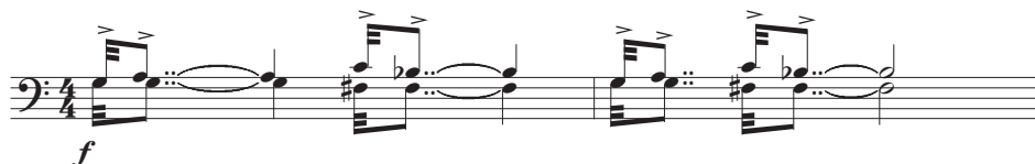
Example 1: Fantasia for Solo Cello , bars 1-2

Centuries of music history tell us that this is a kind of ‘fanfare’. Clearly, it also embodies an element of the ‘Scotch snap’, and I am indebted to Musica Scotica’s general editor, Dr Kenneth Elliott, for the suggestion that it could be heard as recalling the proud and dignified character of a specific Scottish dance-genre: the slow Strathspey. It is heard only in the ‘A’ section of the Fantasia (and its repeat at bars 78ff), but stands out of its context there too, contrasting as it does with most of the rest of the ‘A’ section material. It is clearly intended as ‘beginning’ material, even though in the repeat of the ‘A’ section (bars 78ff) it recurs fragmentarily in the body of the section (bar 97) as well as in the opening phrase; nevertheless, this repeated fragment is marked ‘da lontano’ that is, clearly intended as an ‘echo’, reminding the listener of its ‘beginning’ function.