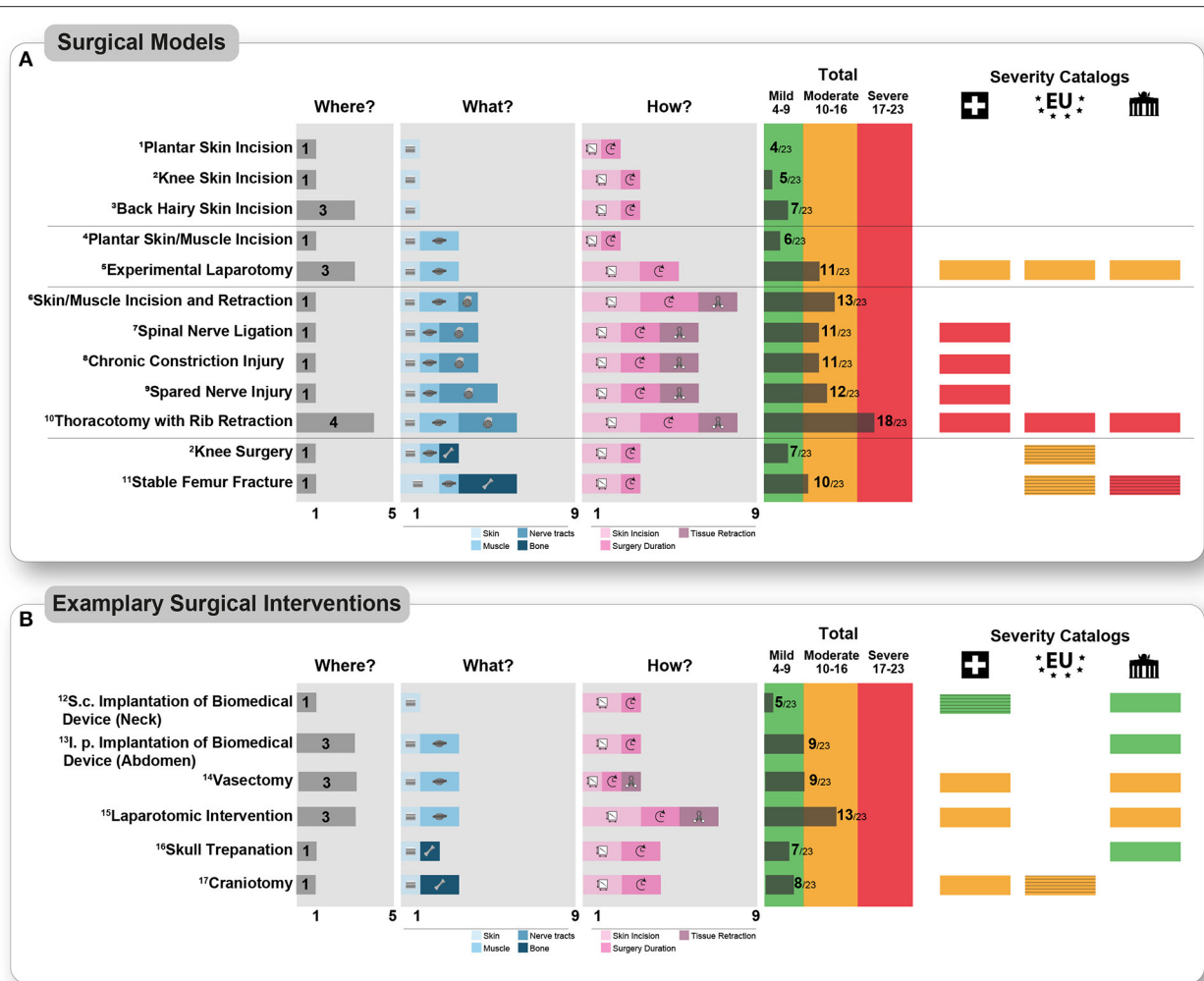
FIGURE 3 | Detailed presentation of the scoring according to the WWHow concept of different pain models (A) and exemplary surgical interventions in biomedical research (B). The corresponding scoring is presented for each intra-operative parameter according to the WWHow concept. The individual factors are displayed pictographically for the “What” (blue shades) and “How” (magenta shades) categories according to the scoring. The total score is illustrated for each surgical intervention without any analgesia treatment and categorized into “mild” (green color, score 4–9), “moderate” (orange color, score 10–16), and “severe” (red color, score 17–23). On the right part of the figure, the severity assessment according to three widely used catalogs, namely the Swiss (Swiss symbol), the EU (EU symbol), and Berlin animal welfare (Brandenburger Tor symbol), are labeled in the corresponding colors if the interventions are listed there. The grading was represented by striped colors if a similar intervention was found. If no corresponding intervention was found in the catalogs, this position is white. 1 Pogatzki and Raja (42); 2 Buvanendran et al. (49); 3 Duarte et al. (50); 4 Brennan et al. (43); 5 Kendall et al. (51); 6 Flatters (30); 7 Ho Kim and Mo Chung (52); 8 Bennett and Xie (53); 9 Decosterd and Woolf (54); 10 Buvanendran et al. (46); 11 Jimenez-Andrade et al. (55); 12 Lu et al. (56); 13 Ren et al. (57); 14 Awsare et al. (58); 15 Ziegłowski et al. (59); 16 Llovera et al. (60); 17 Kyweriga et al. (61).

state. Orthopedic and fracture pain models are particularly worth mentioning here, as various have been developed and established recently (41).