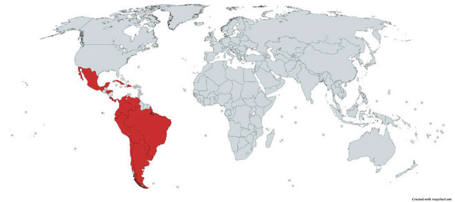
Fig. 1 - Countries of origin of eligible survey respondents.