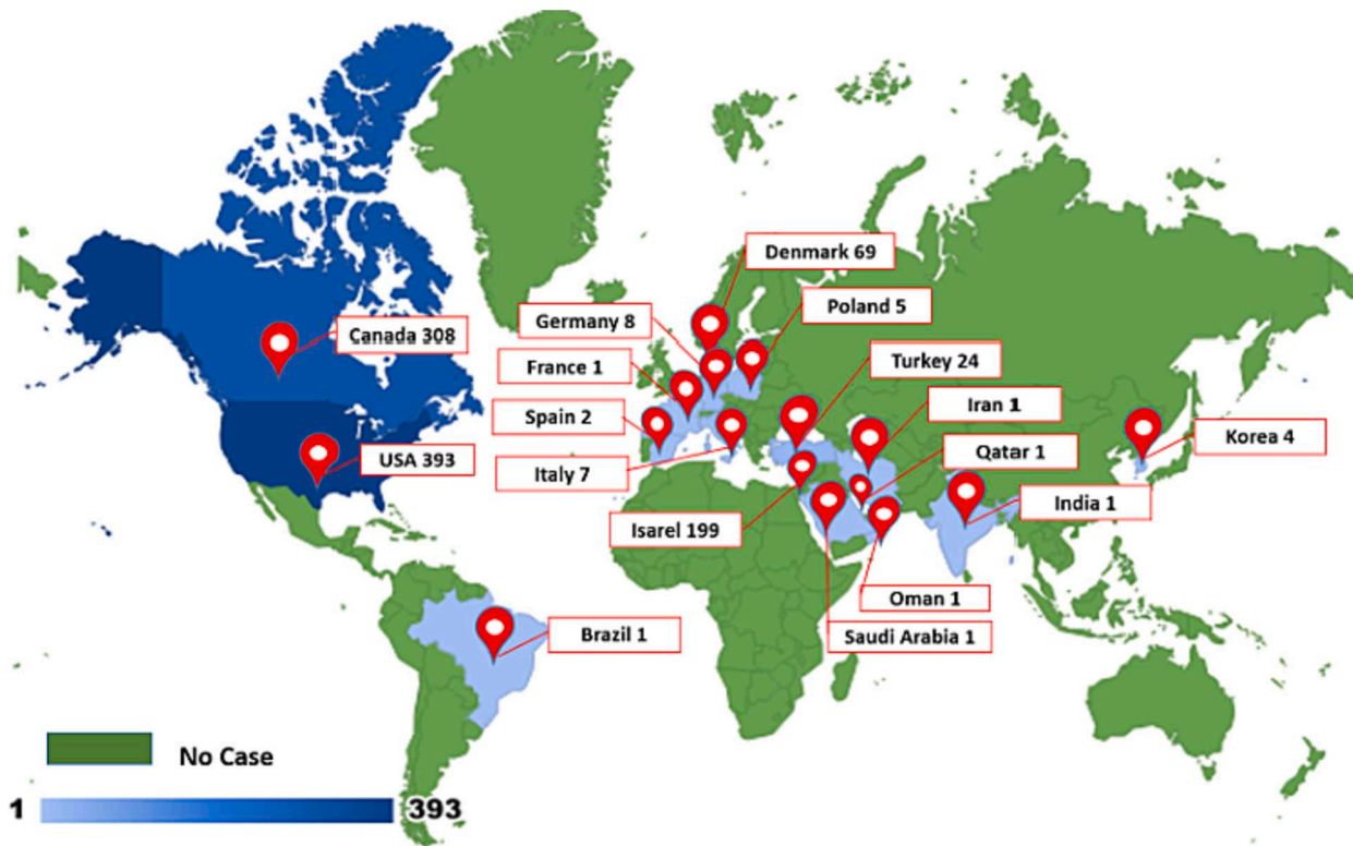
Fig. 3. Geographical Distribution of Cases of Myocarditis after Vaccination (Country, No of cases) based on the systematic literature search.