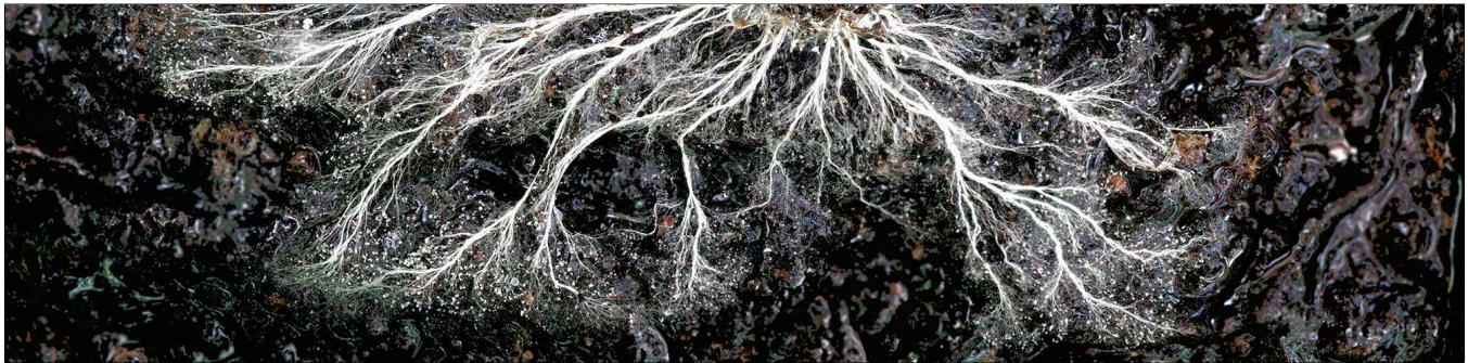
Figure 1. Mirror of nature: Our research, inspired by fungi networks that balance multiple inputs like oxygen and nitrogen, mirrors this complexity in a tokenized system, where each goal and good is represented by a unique token.*

UZH Blockchain Center University of Zurich Zürich, Switzerland