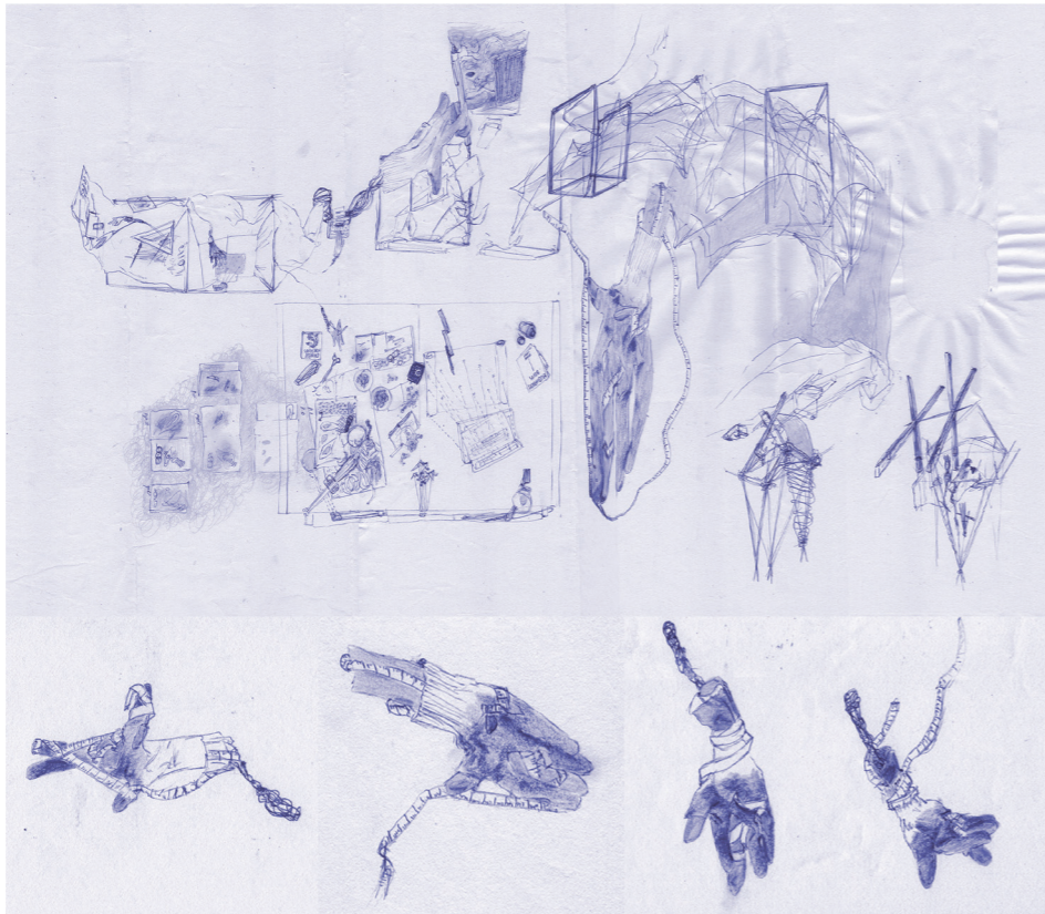
Fig.3 - Extending the macaronic actions into the realm of architectural drawing, we opened a playful exchange between the material and the immaterial through hands-on speculations on the viscosity of drawings, hands, tables and table talks. With these intentions, foods, mouths, texts, drawings, tablecloths, fridges, hands and bellies were blended together. Sila Avar's drawings of the Non-Table Table (2021).

This is a dinner story that has emerged as an outcome of a hybrid workshop 1 titled A Feast on Tableness and Visceral Hands . The workshop invited the participants to venture into a dream of consecutive feasts and its tables, exploring 'a spatial viscosity' through variegated experiments on obscure relations between eating, speaking and drawing. Commencing with challenging the dilemma between eating and speaking, which reflects the traditional opposition between the bodily realm of food and the intellectual realm of the 'word', the workshop critically suggested exploring the liberating modes of macaronic speaking: speaking while eating, misreading texts and transcribing the visceral sound of the mouth.