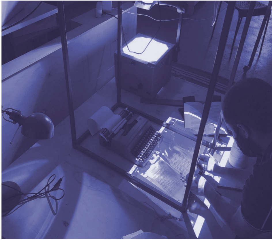
Fig.2 - Exploring the possibilities of macaronic inventiveness also through the projective audio-visual, haptic juxtapositions of online and face-to-face participation, the set transformed into a spatiotemporal act that welcomed a polyphony with no systematic order: moving cameras, moving projectors, delayed network connections critically challenge the boundaries of drawing, hand, body and table. Beshr Jemieh interacting on the collective table (2021).

Bir akşam yemeği öyküsünü "anlatının olasılığından kaçın" (Cixous, 2013) büyüü bir kusurlu kurgu olarak ele alan 'ziyafet'ler, masa dışı olasılıklara ve eleştirel bir çizim pratiğine alan açıyor.