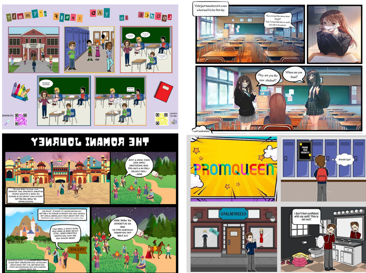
Figure 2. Samples of four digital comic strips (from top left to bottom right): Timmy’s FiSrt Bay of class, Malala, The Romani Journey, and PromQueen.