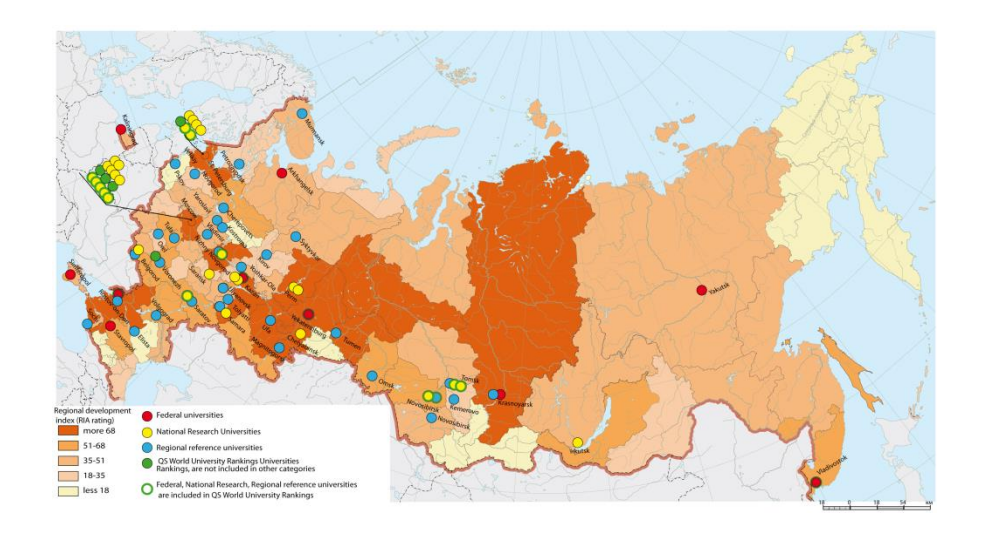
FIGURE 2 TERRITORIAL ORGANIZATION OF THE HIGHER EDUCATION SYSTEM IN RUSSIA AND THE ECONOMIC SITUATION OF THE REGIONS

In 2016, the first 11 regional reference universities appeared, and a year later, their number increased to 33. As in the case of the formation of national research universities, the Ministry of Education and Science did not have a spatial approach when deciding on the creation of flagship universities. Not a single university of this type has been created in the Far Eastern and North Caucasian Federal Districts. However, the process of developing regional flagship universities was suspended since these universities were not opened as research universities, and many of them will not be able to become centers of regional innovative development.