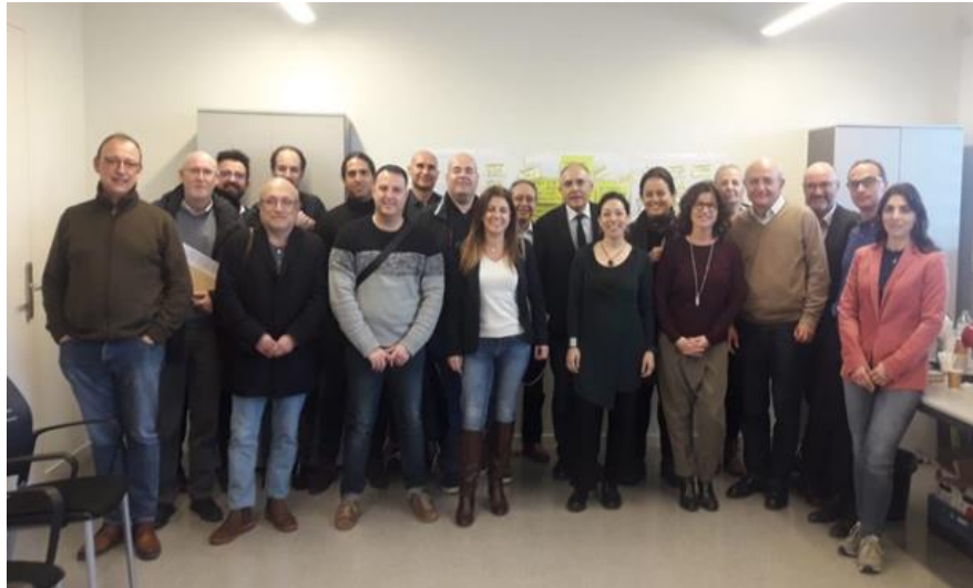
FIGURE 2 “FAMILY PICTURE” OF COL·LAB CATSUD IN 2019

During the first months of CatSud, training was a central activity, individually for the initial entities and for the 50 CatSud Col-laboratory members. By the end of the second year, several innovation projects had been submitted to national and European competitive calls for proposals, some of which have already been carried out or are currently being implemented.