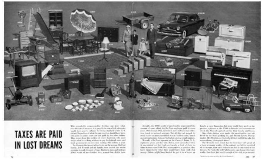
Figure 5. A 1953 issue of Better Living features a working family and the plethora of consumer goods they were forced to forgo due to taxes. Better Living lumped together income taxes, sales taxes, and the "hidden taxes" workers paid in the form of inflated prices.

production, material abundance, and national progress.