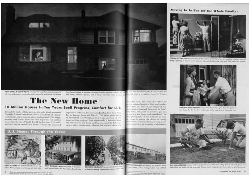
Figure 2. A depiction of a Du Pont family in their home from a 1956 issue of Better Living. Note the comparison with workers' housing in the illustrations and photos at the bottom.