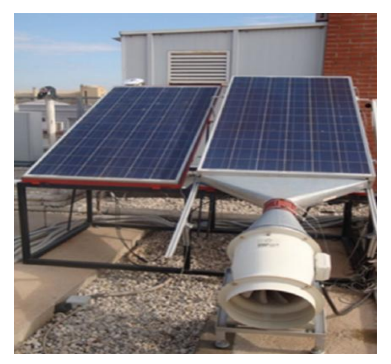
Figure 3: Solar panel with and without cooling fan[20]