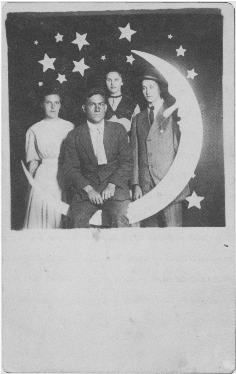
From page six of "Is Moon Travel for YOUR family?"