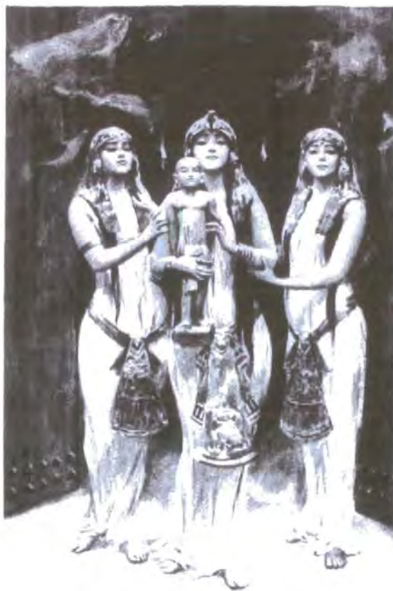
"The doors of the sanctuary were thrown wide and from between them issued—the goddess Isis of the Egyptians" (see page 264).

The illustrator C.A. Michael 38 (fl. 1903-1916) worked for the Cassell & Co. publishing house for which he provided illustrations for the first editions of eight of Haggard's books 39 and two serialisations. 40 Each of the books contains on average only three illustrations – a marked contrast to the earlier richly illustrated Longmans' editions of Haggard's works illustrated by Greiffenhagen amongst others. Michael illustrated Haggard's romance The Ivory Child which charts the retrieval of Lady Ragnall (see above) by Allan Quatermain after her abduction by the white Kendah people of a hidden African land. 41 She becomes chief priestess of the 'People of the Child' (a derivation of Horus worship) and is pictured by Michael in this role in " The doors of the sanctuary were thrown wide and from between them issued – the goddess Isis of the Egyptians ". 42