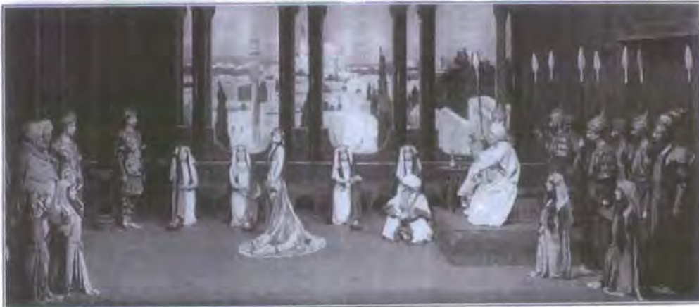
The Almah (a dancer) (Miss Nancy Denvers) dances before the Caliph.

Moving further into the twentieth century, Asche's stage spectacles progressively reveal more 'Oriental' flesh, as is apparent in their promotional photographs in publications like The Playgoer and Society Illustrated . Their spread on Kismet (1911) includes a number of images of veiled 'Oriental' female musicians 72 reflecting the seated or recumbent poses so popular in late-nineteenth century "fine art" paintings of 'Oriental' women. 73 There are photographs of the Caliph receiving 'gifts of fair women from Egypt', one of whom is the scantily clad Miss Nancy Denvers as The Almah who dances for the king, 74 again a fantasy of 'Oriental' female flesh played out on stage. Not only did this 'Oriental' staging give women (and men) the chance to play at "going native", it gave (women and) men the opportunity of seeing semi-clad British women on the stage, made acceptable through their guise as the Other.