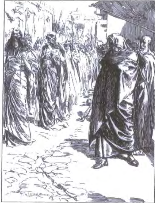
"Tell me, Metem, . . . what mummery is this?"

In "Tell me, Metem, ... what mummery is this?" 32 Elissa is again distinguished by her posture, but more subtly in this earlier image.