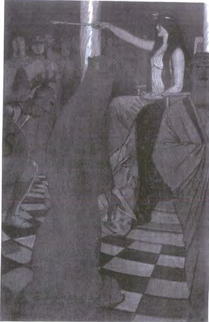
76 'A shadowy Slave arose before the throne and bent the knee to her.'

lines that copy those of the throne and the pillars of fire, so he is again aligning her with the aberrant fire and also with royalty and power. In associating the two, the artist intimates that the fire is connected to her power, an association that Haggard also makes in the text: 'she was awful in her death-like majesty. The blue light of the sunken columns played upon her, and in it she sat erect, with such a face and mien of pride as no human creature ever wore.' 76 The fire is giving an abnormal blue light just as Ayesha herself is not normal. In fact here Haggard emphasises that she seems to be not even human, something that her association with and worship by spirits supports, as at this moment 'She seemed a Queen of Death receiving homage from the dead.' 77