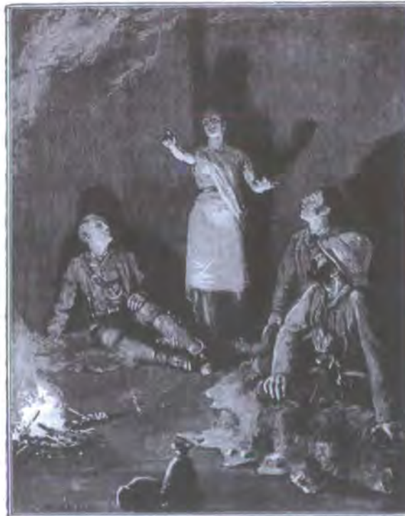
'Thou art my chosen.'

As designated by Haggard Sorais is singing and playing a zither-like instrument, but this picture of a curled-over, downward-looking queen does not reflect the images of power and passion in Sorais' words. 53 In contrast to the regal and strong feminine women created by other Haggard illustrators Kerr's image seems somewhat superficial, related only to the action and not to the inner workings of this romance. Owing to the changes made by Kerr, and the disregard for Haggard's detailed descriptions of the women, the central physical (representing moral) contrast between the sisters is missing. Kerr ignores the orientalisising of Haggard's descriptions of Sorais, instead classicalising her, and thus undermining the strength of Haggard's orientalisising musicality at this moment.