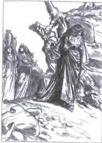
"In ... front walked Elissa"