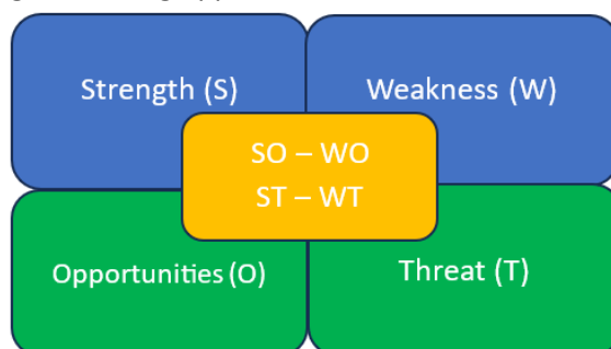
Figure 2. SWOT Framework

The research employs a SWOT analysis method, which involves an assessment of the internal and external conditions of the fisheries environment in the East Java region. The analysis undertaken aims to identify the strengths, weaknesses, opportunities, and threats within the aquaculture sector in East Java. This assessment relies on qualitative and secondary data from the fisheries department and the Ministry of Marine Affairs and Fisheries. Subsequently, based on the findings of this analysis, strategic formulation is carried out using the TOWS method. TOWS represents a strategy developed to address weaknesses and challenges by leveraging strengths and capitalizing on existing opportunities.