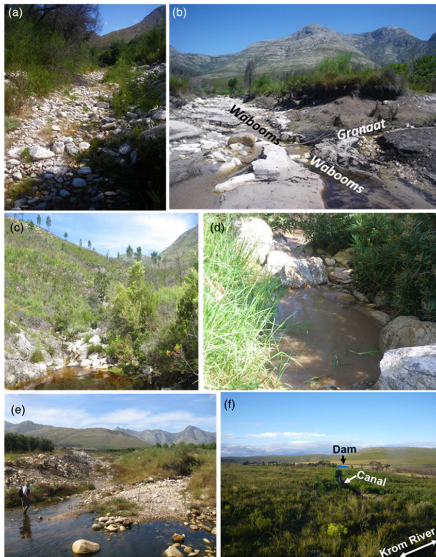
FIGURE 4 Some of the major threats to Galaxias sp. 'Joubertina': (a) over-abstraction of water and bulldozing in the Twee River; (b) sedimentation, erosion and siltation of the Wabooms and Granaat streams due to the Joubertina dam; (c) invasion of the riparian zone by Pinus trees along the Wabooms River; (d) increased water turbidity in the Diepkloof River resulting from irrigation back-flow; (e) habitat homogenization caused by bulldozing in the Krakeel River, and (f) canal (in which bass was collected) diverting water from the Krom River into a farm dam

therefore prevent recolonization by native fishes. Canals that connect the Krom and Twee streams could have facilitated, and may still be