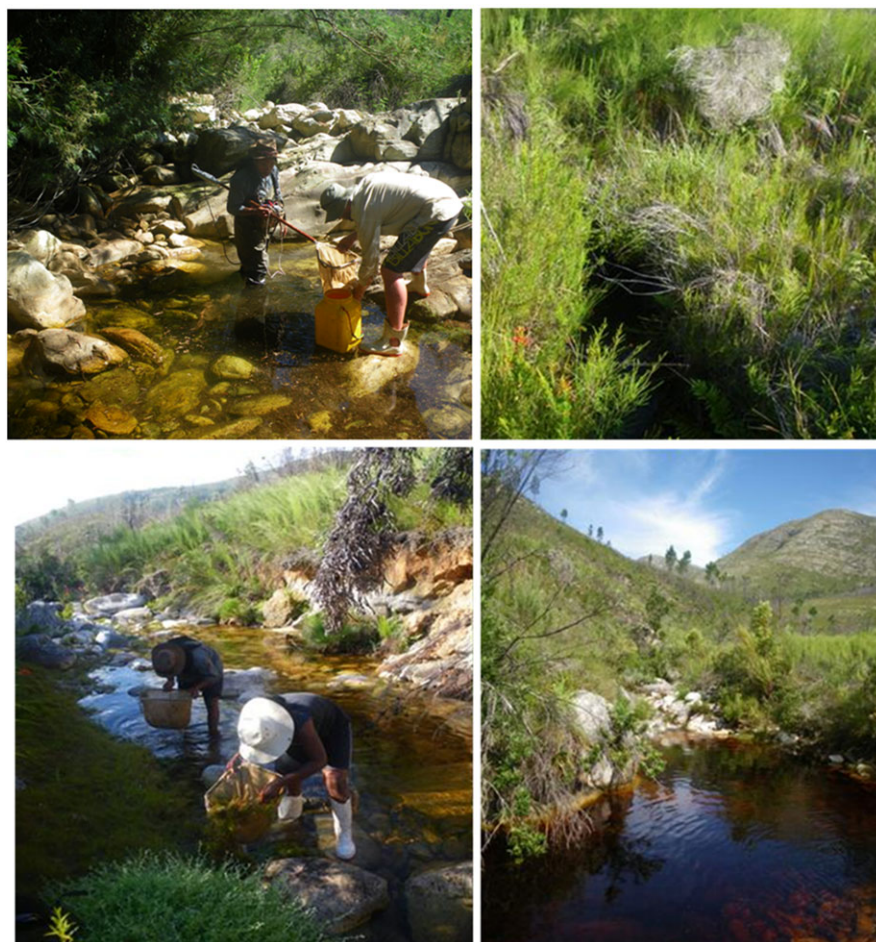
FIGURE 3 Typical habitats where Galaxias sp. 'Joubertina' were collected