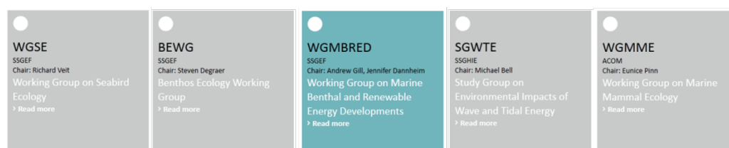
Fig 1. ICES groups closely linked to WGMBRED