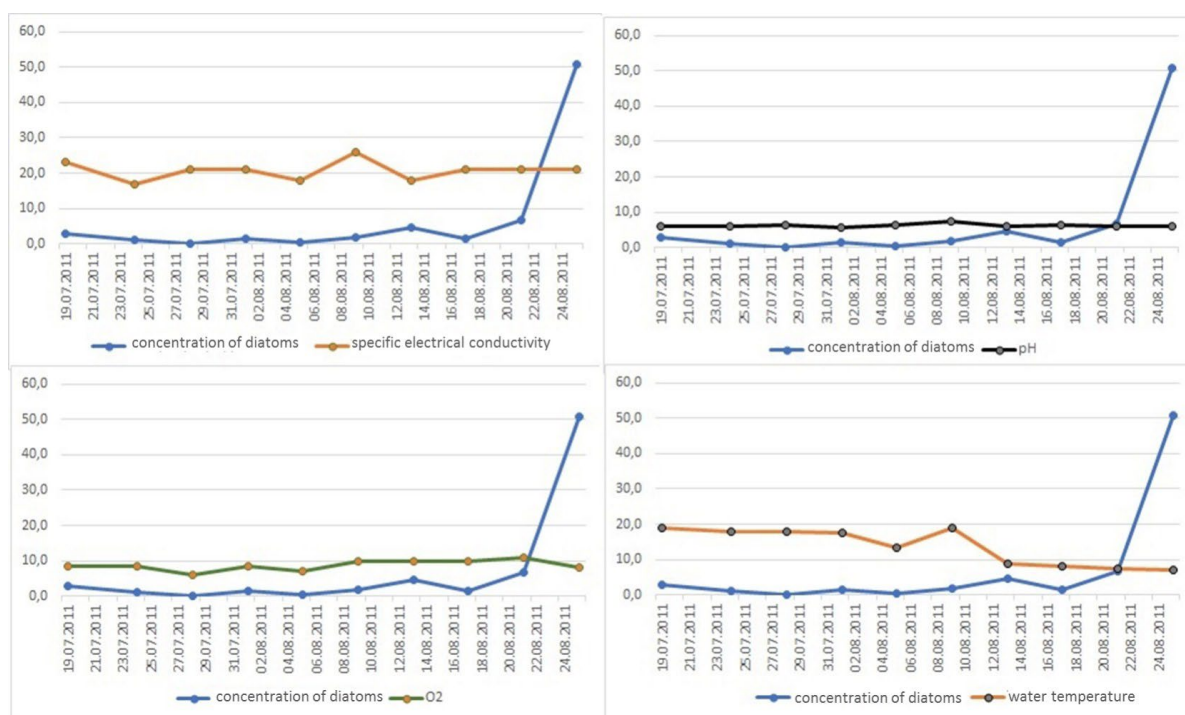
Fig.1. The ratio of physical parameters of water and concentrations of diatoms in the phytoplankton of the model reservoir.

In order to determine the water quality of the studied lakes, saprobity indices were calculated using 41 types of diatoms-saprobity indicators. Of these, 9 species characterize the oligosaprobic zone, 5 – beta-mesosaprobic, 4 – xenosaprobic and 1 – alpha-mesosaprobic. Calculated indices of saprobity by diatoms for the studied lakes range from 0.6 to 1.1, i.e. in terms of pollution they belong to class I “very clean” and class II water quality “clean” (Fig. 2). At the same time, a relatively high saprobity index was noted on 09.08, when all measured water parameters were high.